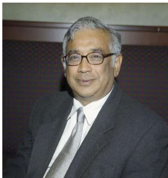
Srinivasa S. R. Varadhan, winner of the 2007 Abel prize.

The Abel Prize, the mathematician's version of a Nobel Award, was awarded in Oslo on May 22, 2007, by King Harald of Norway to Srinivasa S. R. Varadhan. The Norwegian Academy of Science and Letters cited Professor Varadhan "for his fundamental contributions to probability theory and in particular for creating a unified theory of large deviations." Professor Varadhan is on the mathematics faculty of the Courant Institute of Mathematical Sciences, New York University, where he started as a postdoctoral fellow from 1963 to 1966. He was born in Madras (Chennai), India, and received his B.Sc. and M.A. from Madras University. His Ph.D. from the Indian Statistical Institute, Calcutta, was obtained with the distinguished Indian statistician C. R. Rao as his thesis adviser. The Abel Prize carries a cash award of about $875,000.