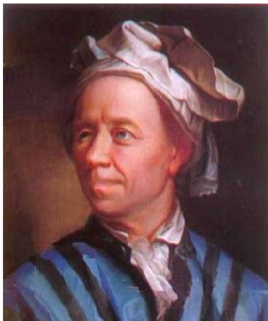
Leonhard Euler (1707-1783)

Everyone who has received a mathematics degree recognizes the name of Euler (even if they badly mispronounce it). Leonhard Euler was truly one of the greatest mathematicians of all time—one whose stature is to be compared with people like Newton, Einstein, and Galileo. April 15, 2007, marked his 300th birthday, and celebrations have been going on all year. Euler was born in Basel and lived and worked for many years in St. Petersburg. Basel had a month-long celebration in May/June, and St. Petersburg had a special Festival in his honor June 10-12, 2007, but has also had many celebratory events in May and June in recognition of his work. ALL the major mathematics professional organizations have had or will be having major events to mark Euler's influence. During his life Euler published some 560 books and papers and left many unpublished manuscripts at his death in 1783. As Dirk Struik's book notes, "He made signal contributions in every field of mathematics which existed in his day." The Math. Association of America has just published FIVE new books on Euler, which can be ordered through www.maa.org .